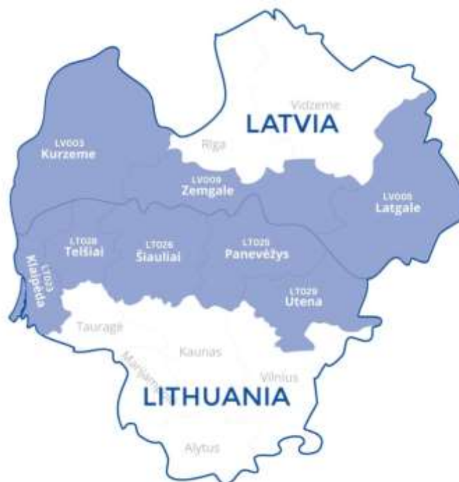
Figure No. 1. Programme area