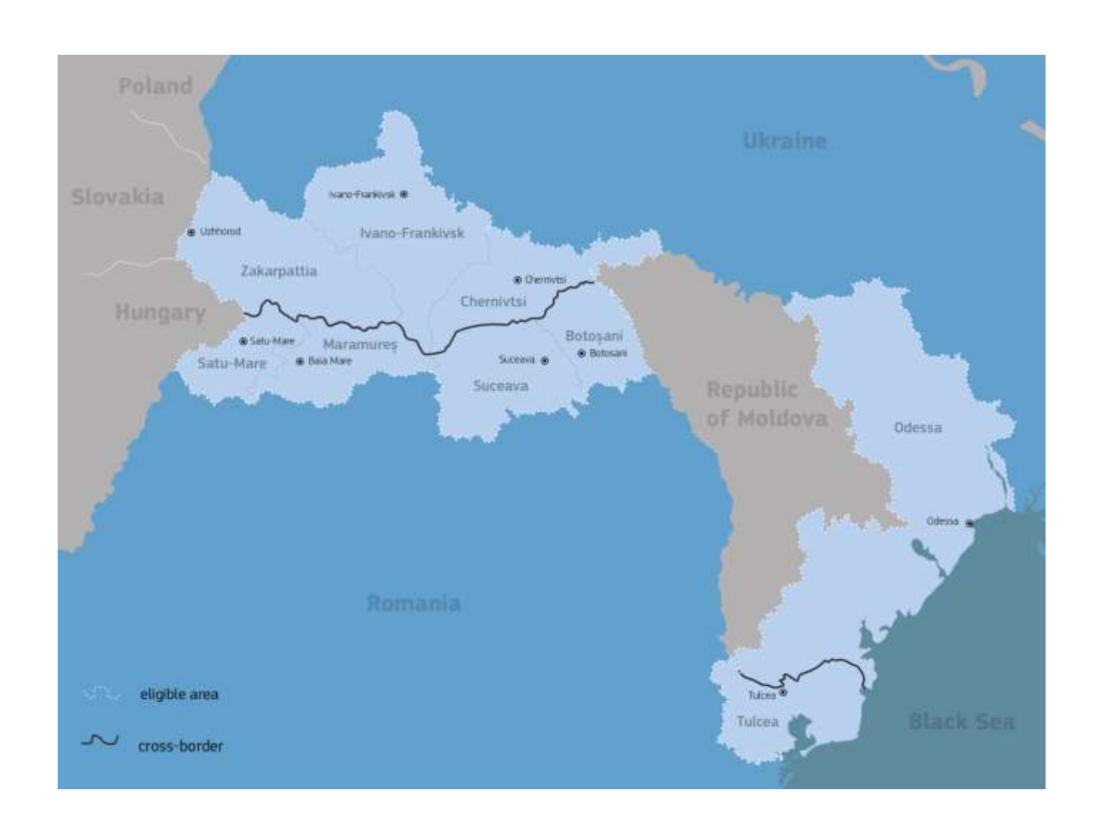
Map Map of the programme area