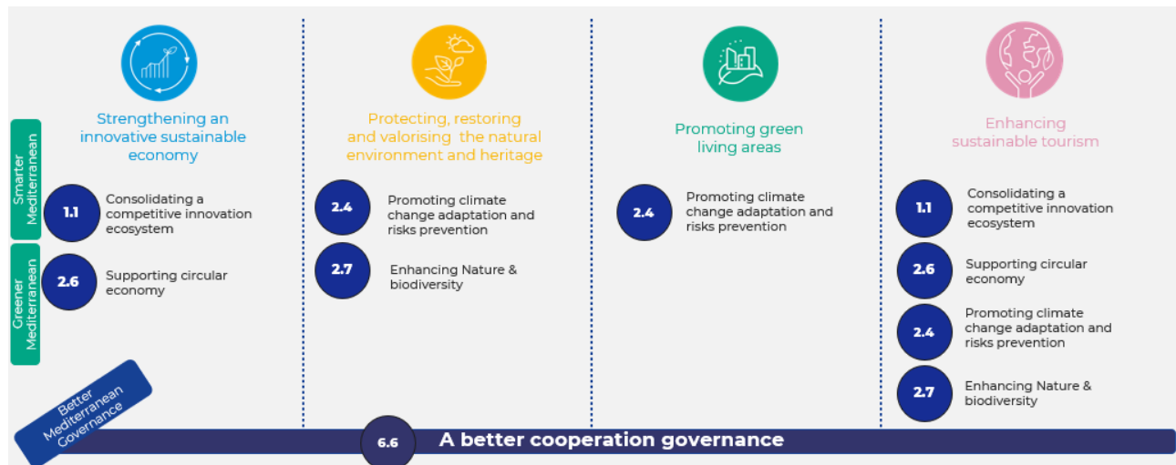
Illustration of the structure of the programme and types of projects: Priorities, Specific Objectives and Missions.

All the Thematic projects operating under each mission are supported by one Thematic community project and one Institutional Dialogue project.